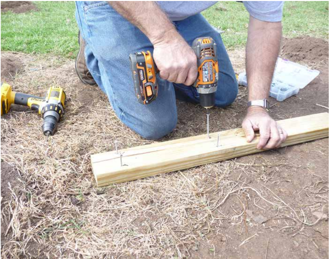
Pre-install screws to make vertical frame member installation easier.