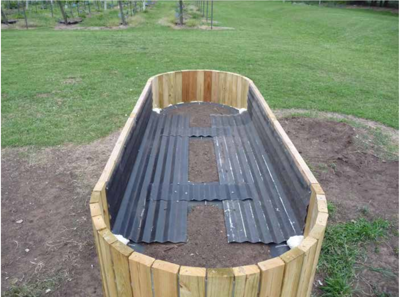
Completed bed ready to fill with amended topsoil or containers.