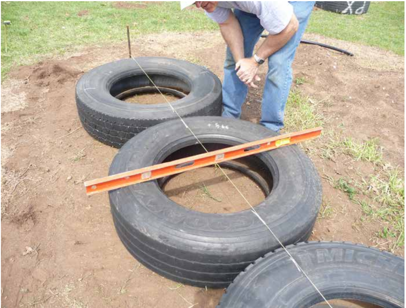
A carpenter's level may be used to ensure the base is level side to side.