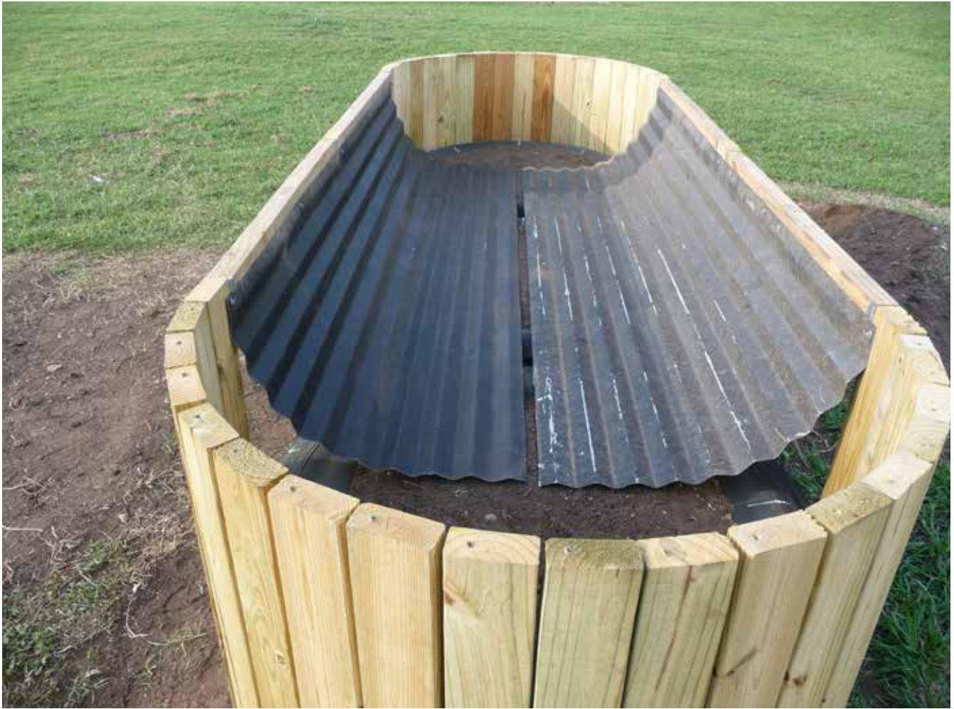
Both sections of the liner attached to the top of the frame using five screws per side.