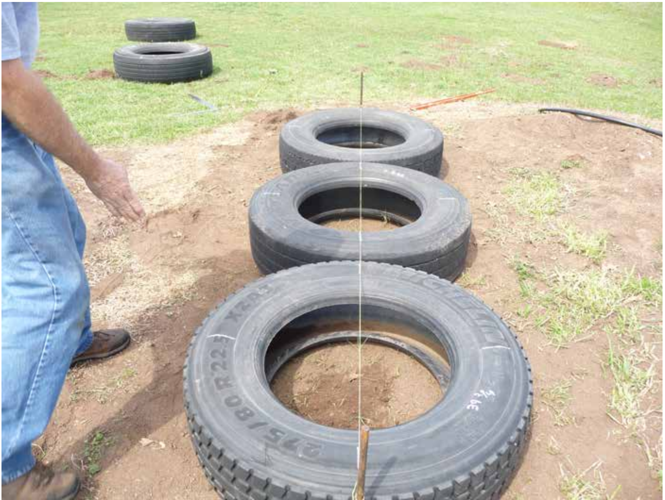
Tires perfectly aligned in a row. Using this procedure to align the tires is especially helpful when constructing long beds because the longer the bed, the more difficult it becomes to use line of sight to center objects like tires that do not have straight edges.