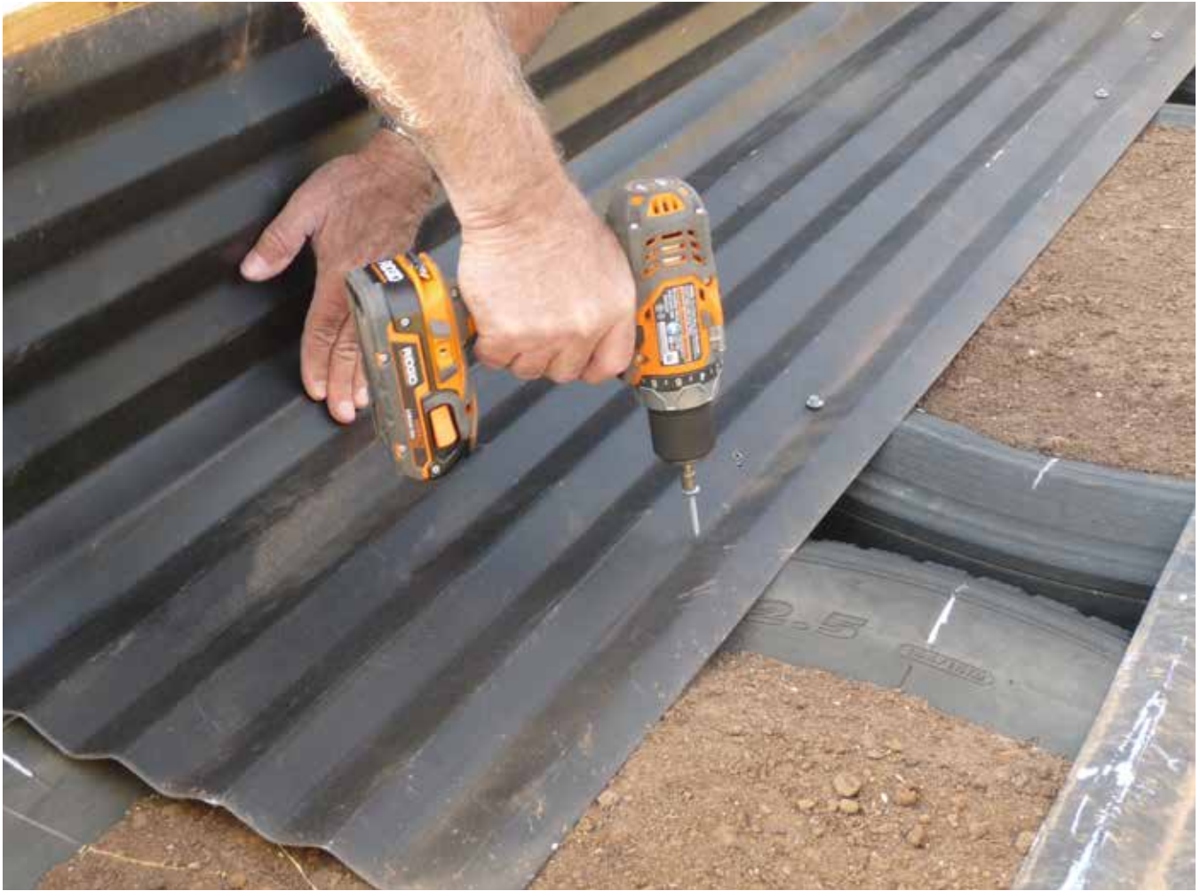
Holding the liner in position, attach the free end to the tire base, using roofing screws.