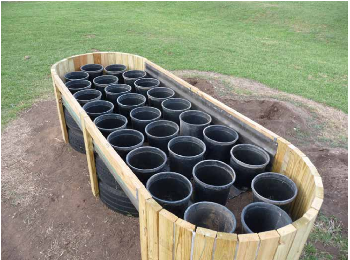
One of many container options using the easy access raised garden bed.