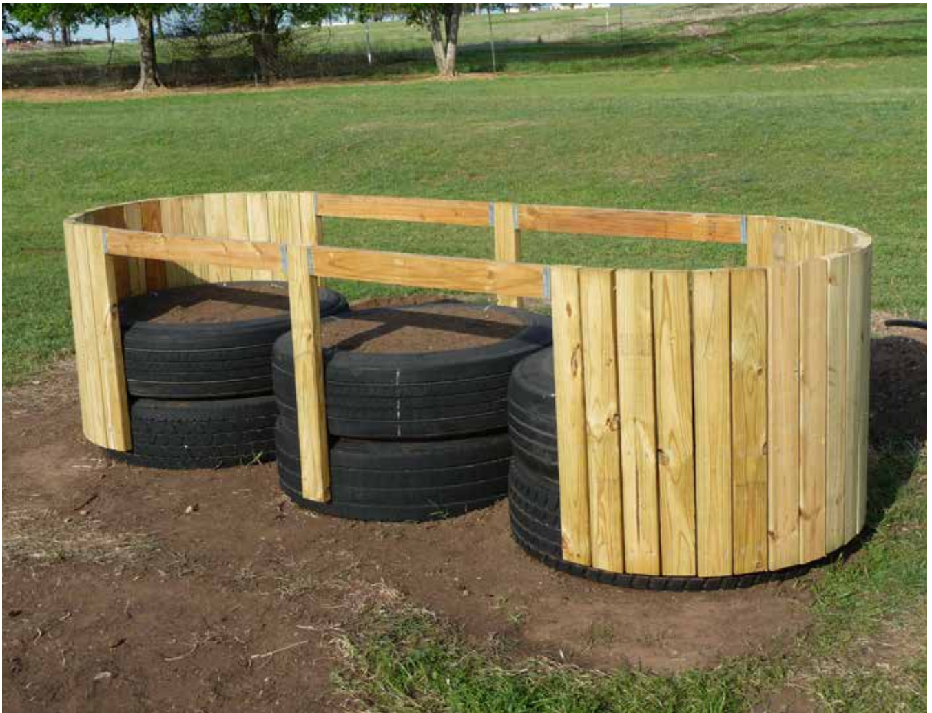
A completed frame ready for installation of the metal liner.