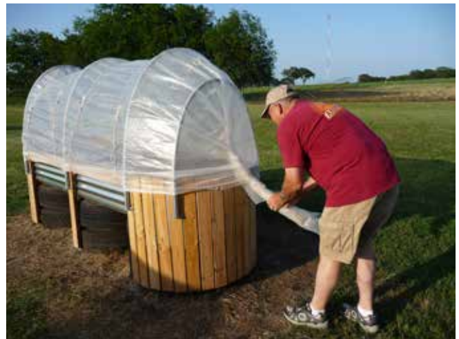
While holding the wrapped tennis ball, pull the film toward you and twist the film clockwise creating an ever tightening roll of film.