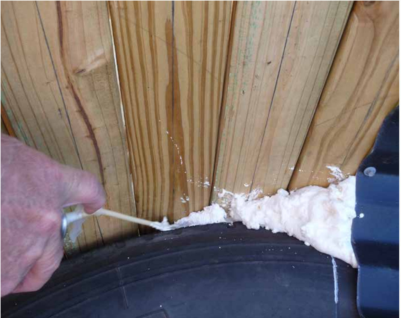
Use foam sealant to seal gaps between vertical frame members and tires on each end of the bed.