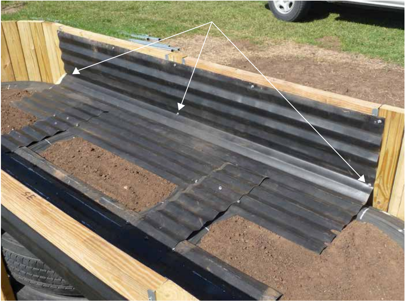
Finish liner installation by inserting three screws in the middle of each liner section along the fold.