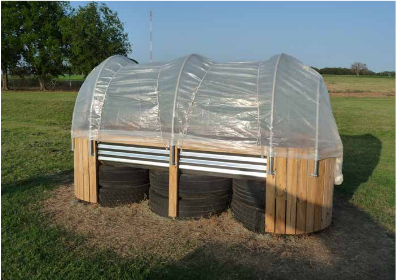
A properly tensioned poly cover.