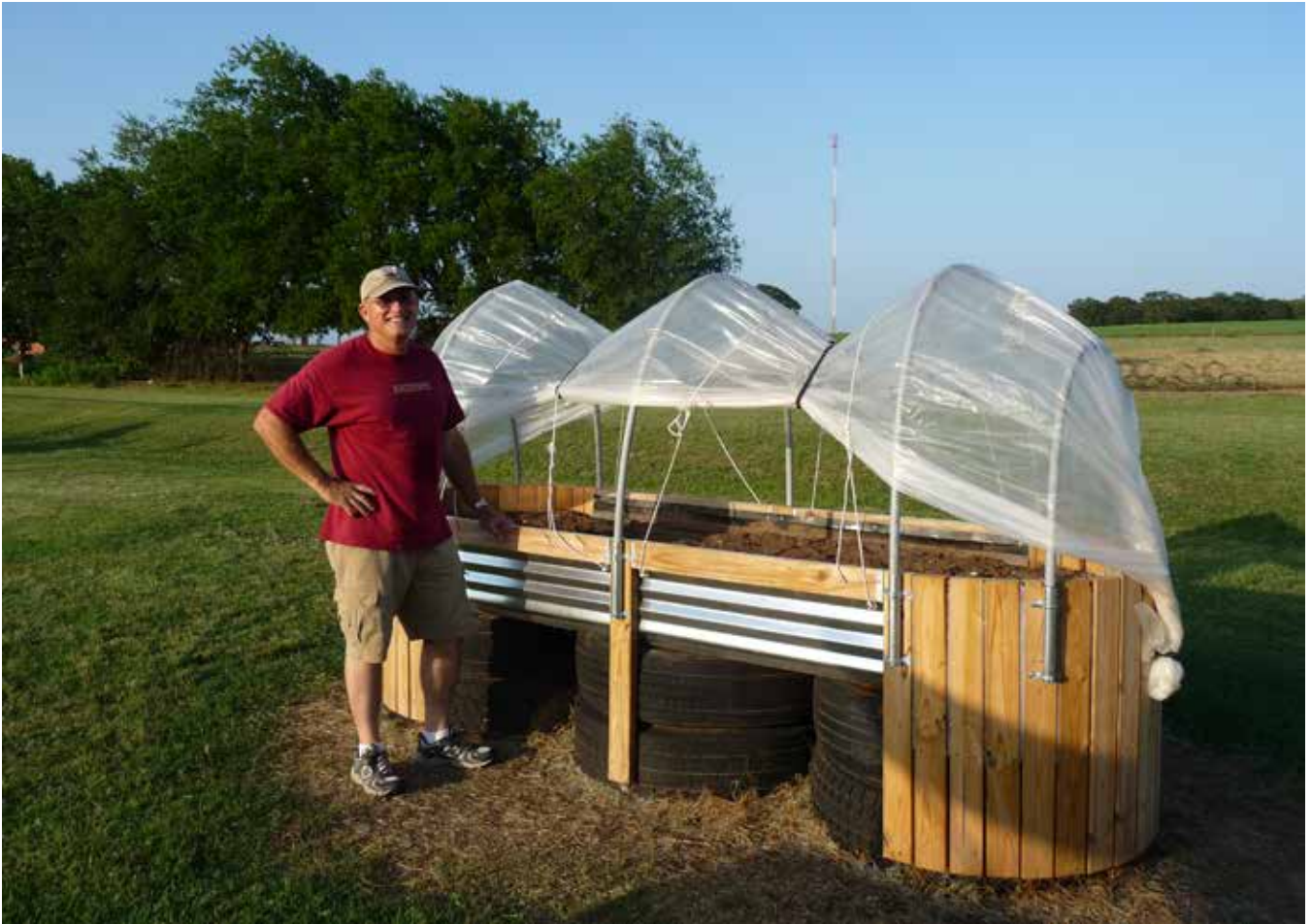
The use of 4-foot bungee cords to maintain the cover in a fully vented position.