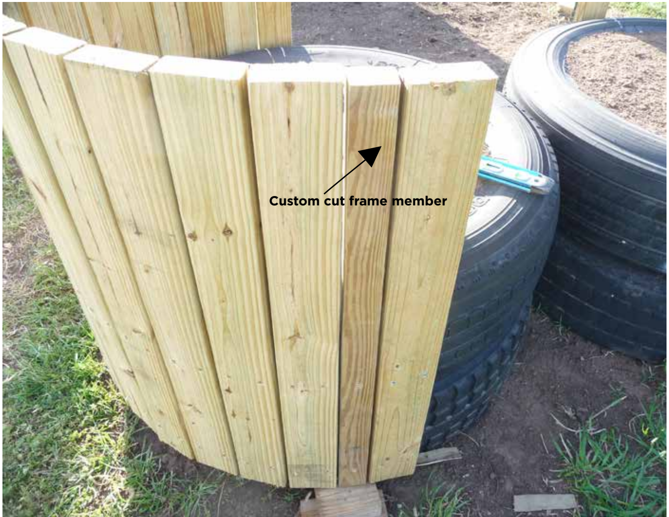
Cut to fit the last vertical frame member installed on each end of the bed.