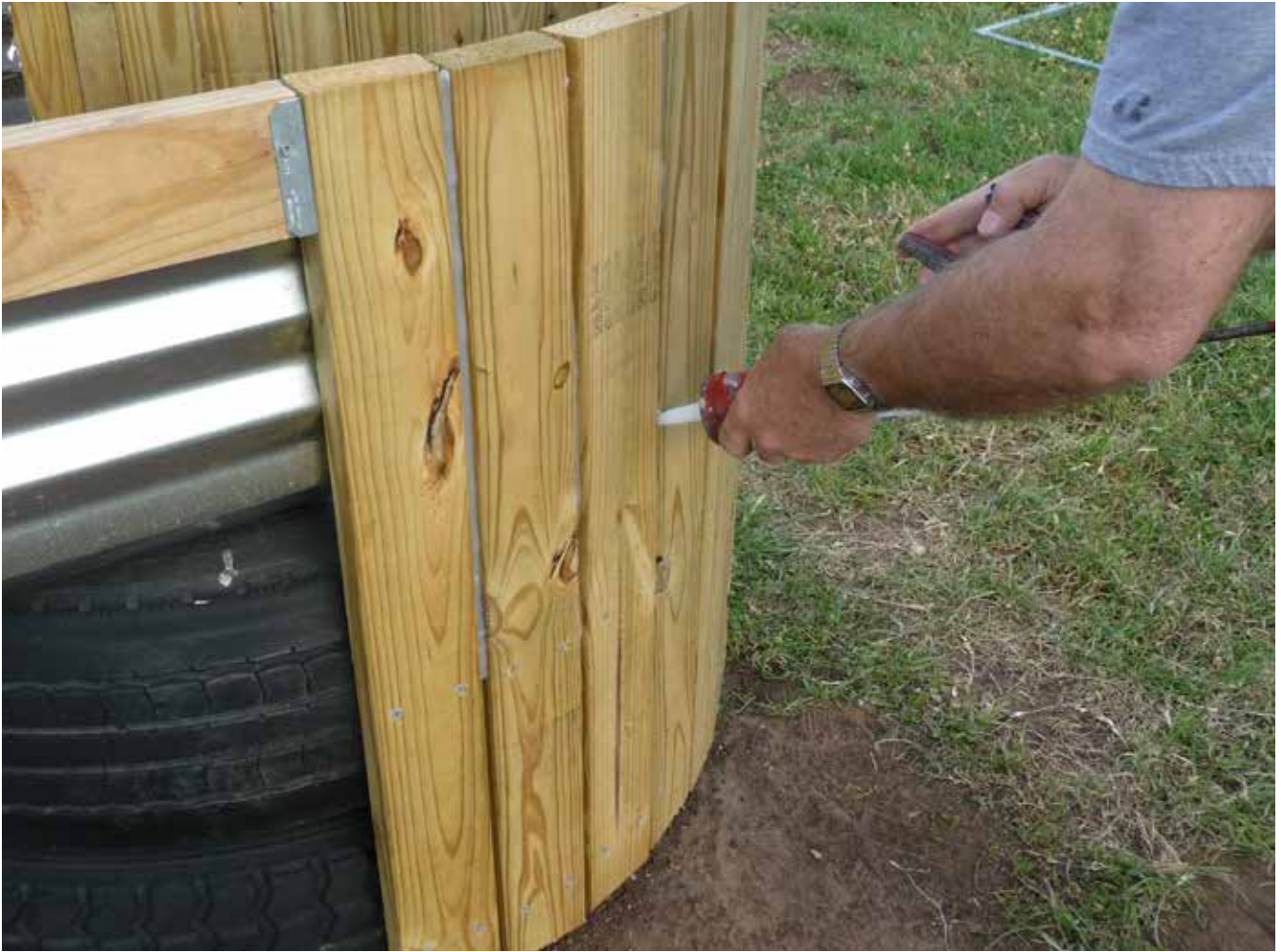
Seal gaps between the vertical frame members using clear silicon caulking.