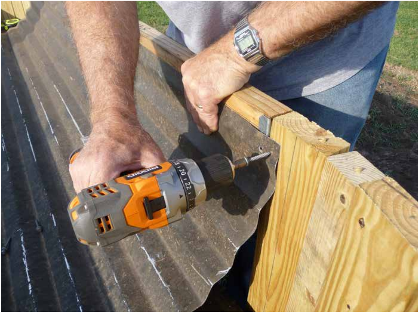
Attach the liner to the frame using 1 1/2-inch self-tapping roofing screws.