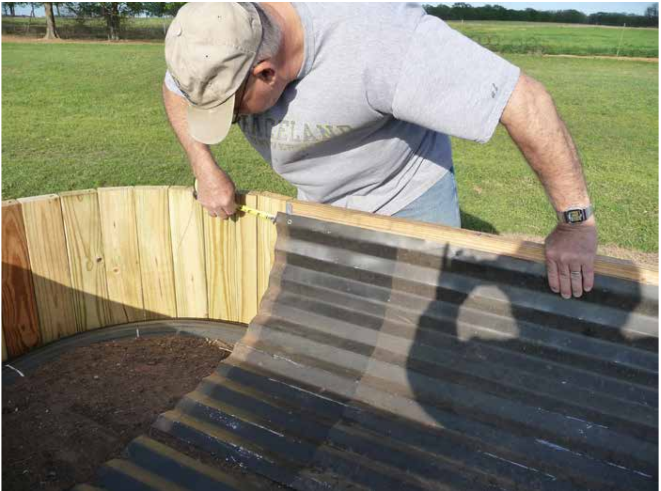
Center a section of the liner on one side of the bed, and align the top with the line on the cross members.