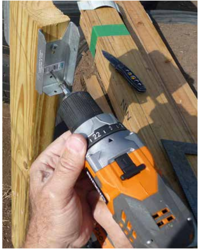
Drill pilot holes prior to attaching bracket. Use 1-inch wood screws to fasten bracket to frame member.