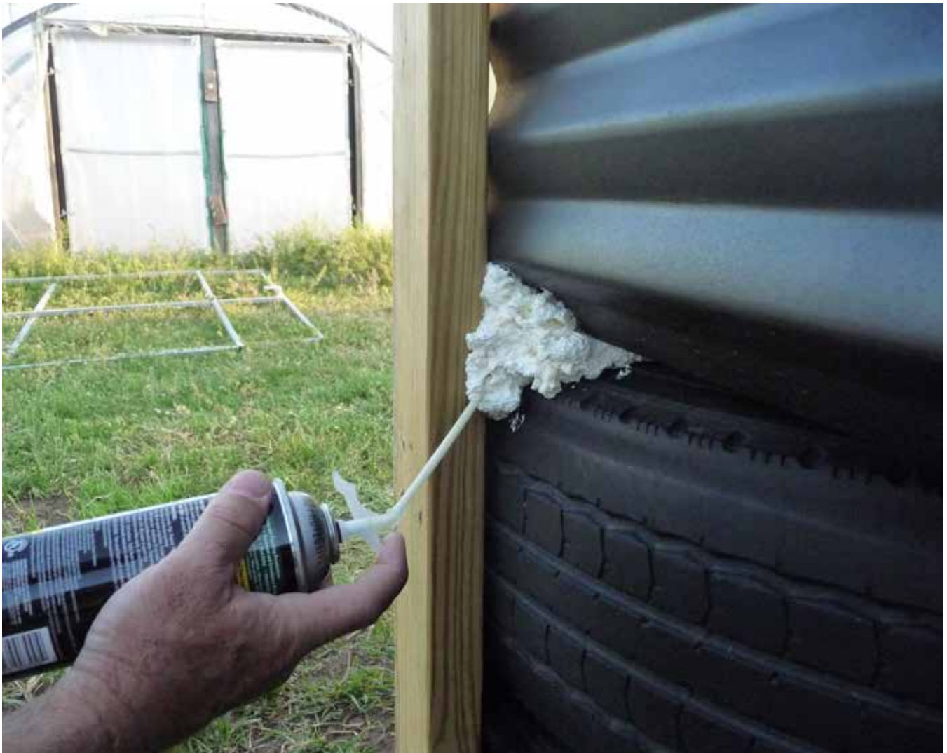
Seal gaps at all four corners of the bed using foam sealant. After the foam cures, use a knife to remove excess.