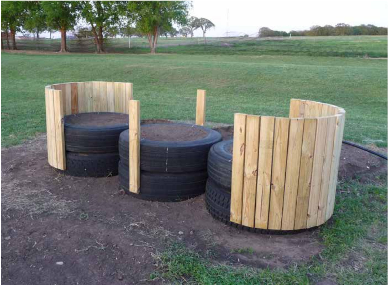
Completed installation of vertical frame members. A total of 40 vertical members are needed when constructing a 10-foot-long bed.